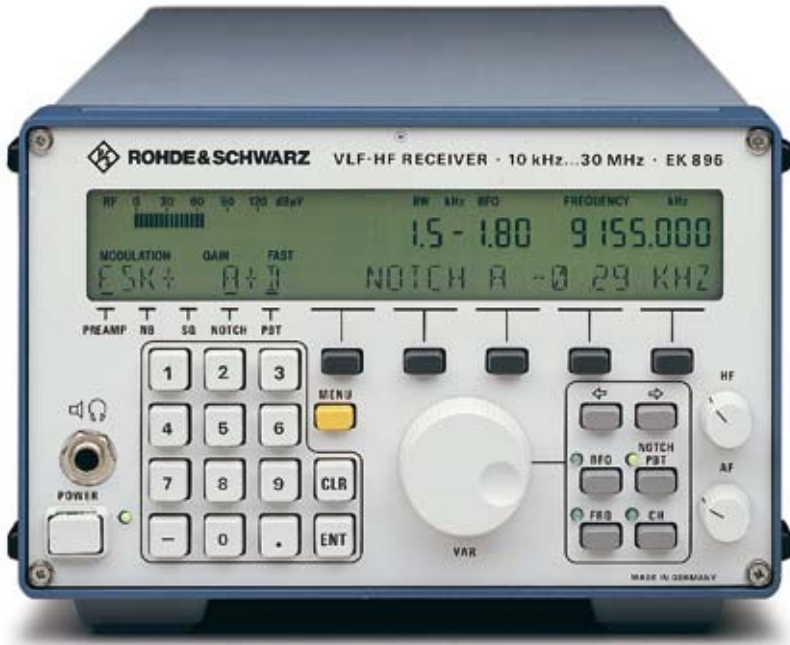
R&S®EK895 VLF-HF receiver with control panel