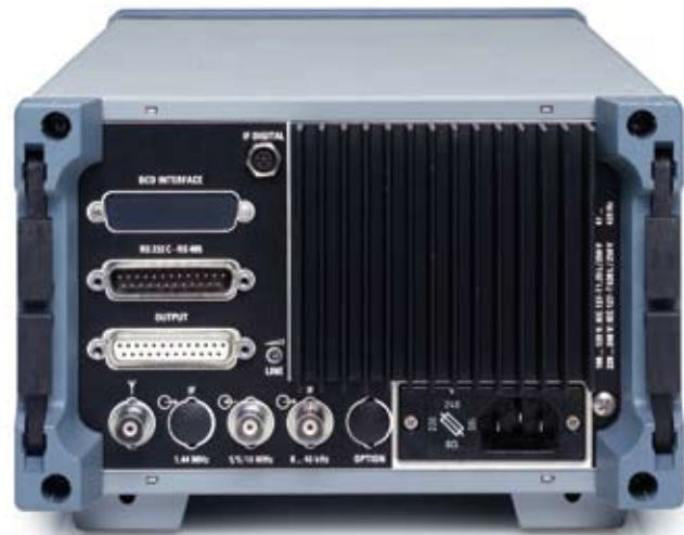
Rear view of the R&S®EK895