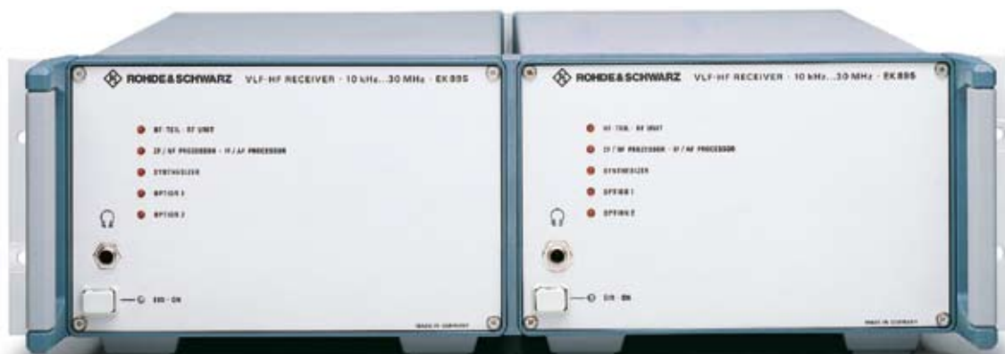
Two independent R&S®EK895 receivers with remote-control panel in a 19" rackmount adapter

The built-in memory has capacity for nonvolatile storage of 1000 complete channel settings so that channel management and control by an external computer are not required but are nevertheless additionally possible. Due to their excellent characteristics regarding dynamic range, low synthesizer noise and gain control range, the receivers are ideal high-performance frontends for subsequent signal processing.