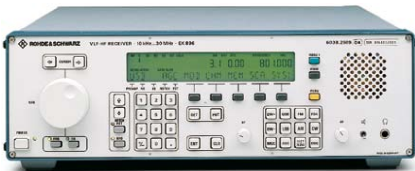
R&S®EK896 search receiver with front panel for local/remote control

In the basic version, all the frequencies are derived from a temperature-compensated crystal oscillator. Higher accuracy requirements can be fulfilled by including a heated crystal oscillator (optional OCXO) or using an external frequency standard (1 MHz, 5 MHz or 10 MHz).